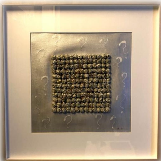
Collage from Rita Hadorn

«I work with colored pencil and chalk on paper: dry colors, slow means of work. They demand concentration and endurance. And offer unlimited possibilities for combinations, compositions, interweaving. Once something is on the paper, I can't erase it, but I can continue working with fixative spray and eraser: Layers fade, new layers grow over them» Quote www.mariann.ch