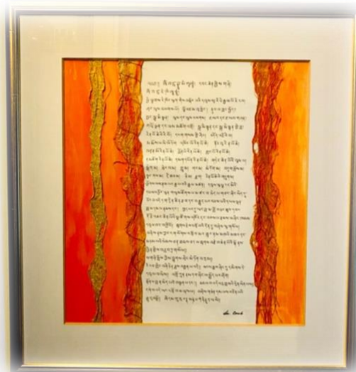
Collage from Rita Hadorn