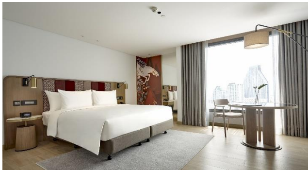
Deluxe room 30 sqm